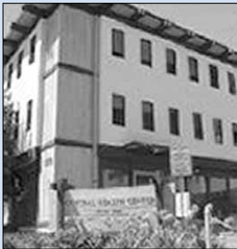
Family Justice Center