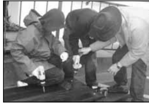
Troop #11 at work