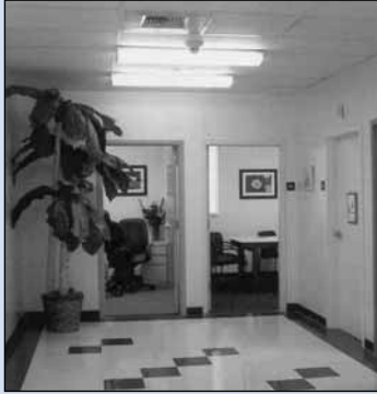
CALICO's Corner at the Family Justice Center